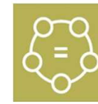
COMPREHENSIVE & EQUITABLE