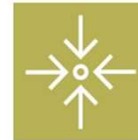
COORDINATED & INTEGRATED