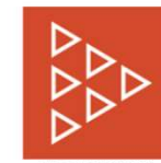
TEAM-BASED & COLLABORATIVE