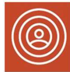
PERSON & FAMILY CENTERED